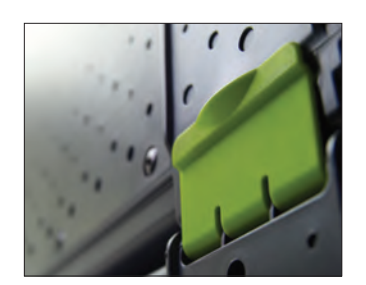
Side clips allow you to connect multiple tubs together and easily break apart for sharing devices