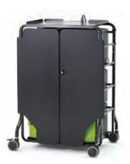
Premium Cart High security model with locking doors