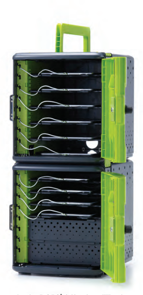
Premium Tech Tub ° - holds either 6 iPads°, Chromebooks™, or a combination of both (FTT600)