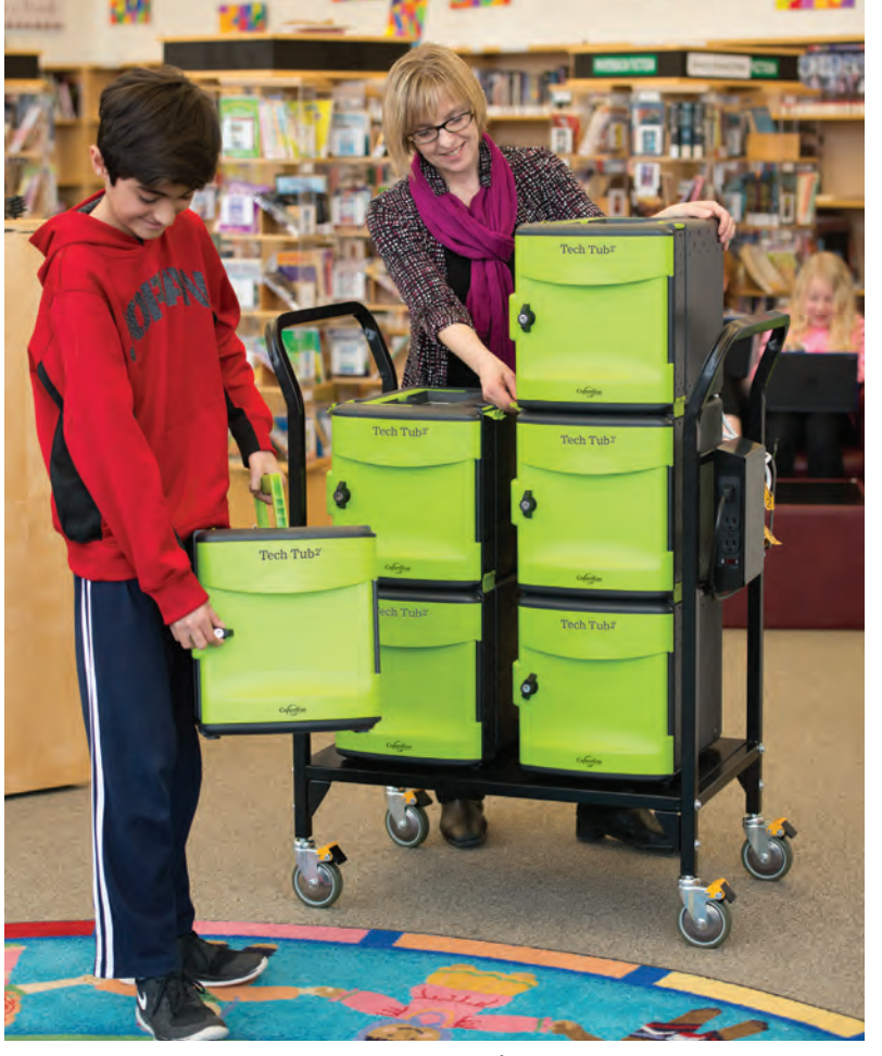
Modular Cart with 6 Premium Tech Tubs® - holds 32 devices (FTT632)