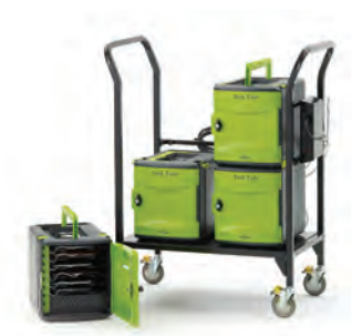
Modular Cart with 4 Premium Tech Tubs* - holds 24 devices Tubs break apart using clips (FTT624)