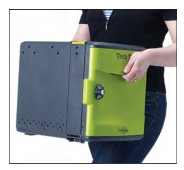
Ergonomic front and back handles