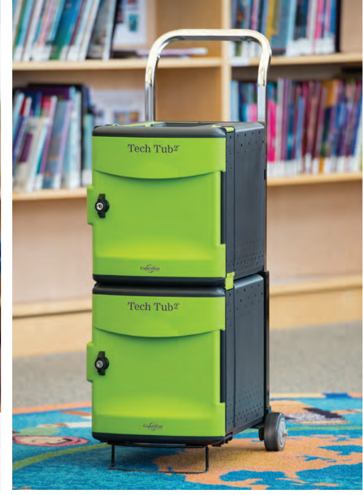
Premium Tech Tub * - holds 10 devices (FTT1000)