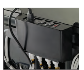
Premium Cart Power timer for charging (requires 1 outlet)