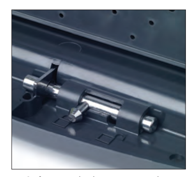
Surface mount hardware to secure tub to surfaces for added security