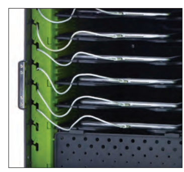
Side cable organizer to keep cords tidy