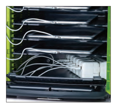
Lower compartment for power strip and adapters