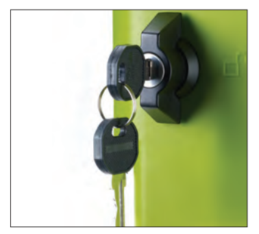
3-point door lock with 2 keys