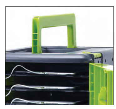
Top flip-up handle to make carrying easier